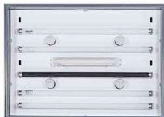
CAC LED 60-5 lamp deck