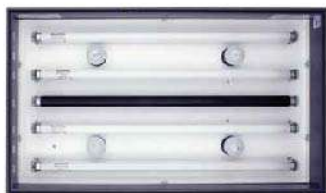
CAC60 lamp deck