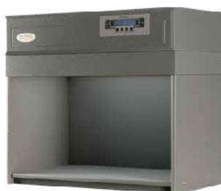
CAC60 Cabinet fitted with Diffuser

Benches are also available, allowing you to position your cabinet at the optimal observation height when used in conjunction with a VeriVide cabinet. Benches with plan drawers can also be supplied. (Further details on our Accessories Datasheet).