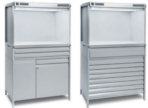
CMB-2540/LED shown with two shallow flat file drawers and storage cabinet at left; and shown with one deep file drawer and eight shallow flat file drawers at right.