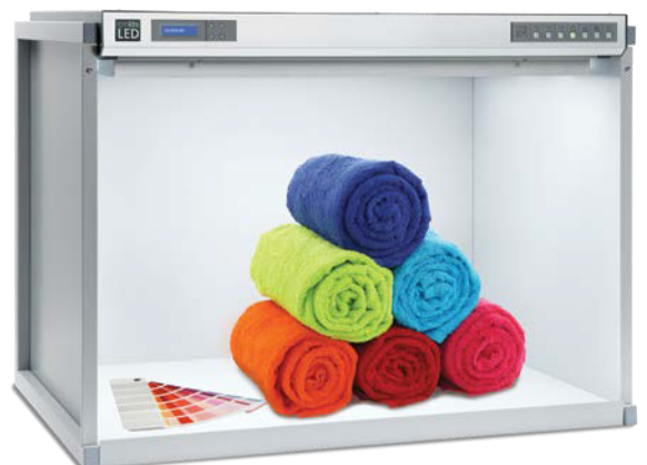
Desktop version of CMB-2540/LED