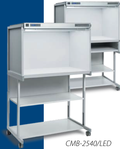
CMB-2540/LED with floor stand on left; and with floor stand and table riser on right.