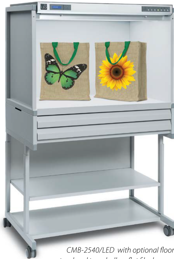
CMB-2540/LED with optional floor stand and two shallow flat file drawers

Premier LED Viewing Booths for Color Matching and Inspection