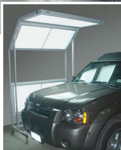
Above: A custom color harmony room featuring multi-source GLE luminaires and wireless remote control